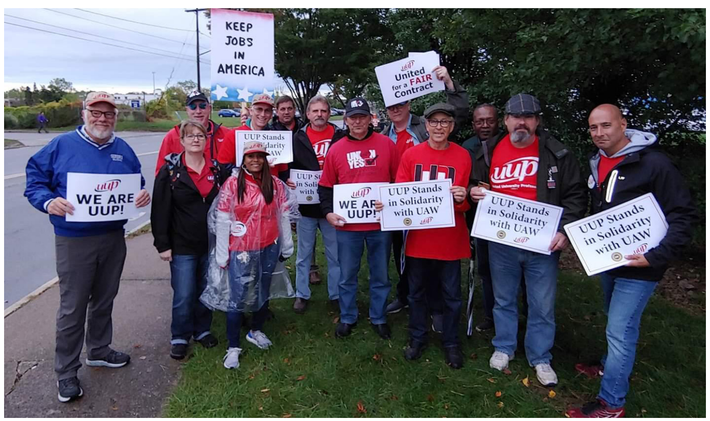
UUP members at the UAW rally in Rochester October 2nd.